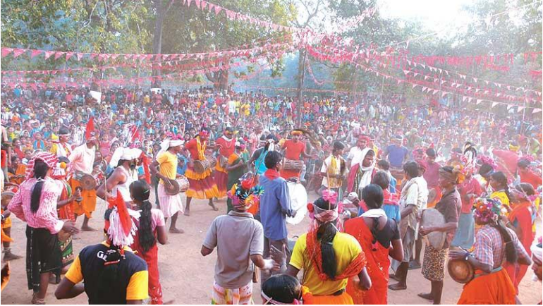
Gathered Storm: Dance troupes of various Janatana Sarkars perform on Bhumkal Day