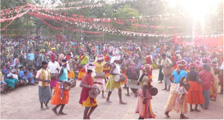
Women guerrillas supervise the backstage for the Bhumkal feast. Bhumkal an annual ceremony means Earthquake