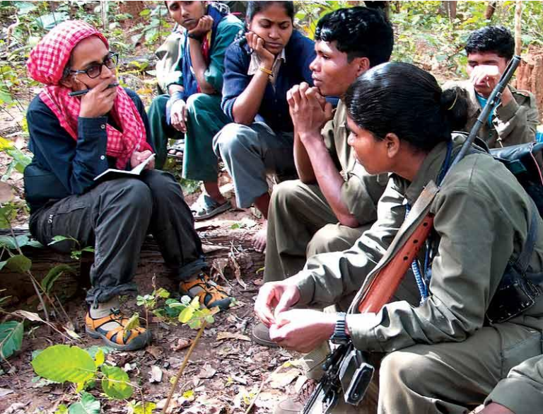
Dateline Dantewada: Roy with the Maoists

Last month, quietly, unannounced, Arundhati Roy decided to visit the forbidding and forbidden precincts of Central India's Dandakaranya Forests, home to a melange of tribespeople many of whom have taken up arms to protect their people against state-backed marauders and exploiters. She recorded in considerable detail the first face-to-face journalistic "encounter" with armed guerrillas, their families and comrades, for which she combed the forests for weeks at personal risk.