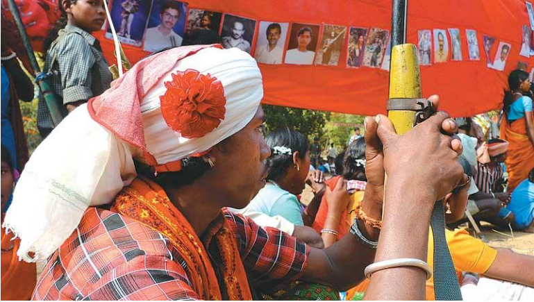
Remembering The Martyrs: Pictures of slain comrades displayed on Bhumkal Day