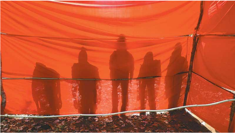
Red Shadow: Centenary celebrations of the adivasi uprising in Bastar; Sten gun at hand