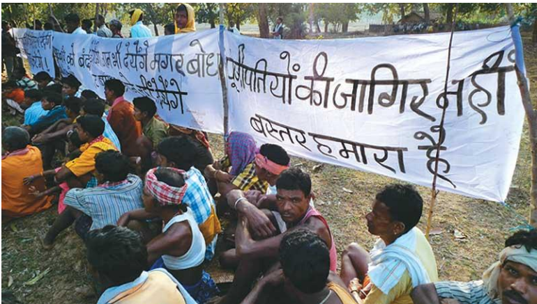
Staying Put: People of Kudur village protest the Bodhghat dam: 'It does not belong to the capitalists, Bastar is OURs'y