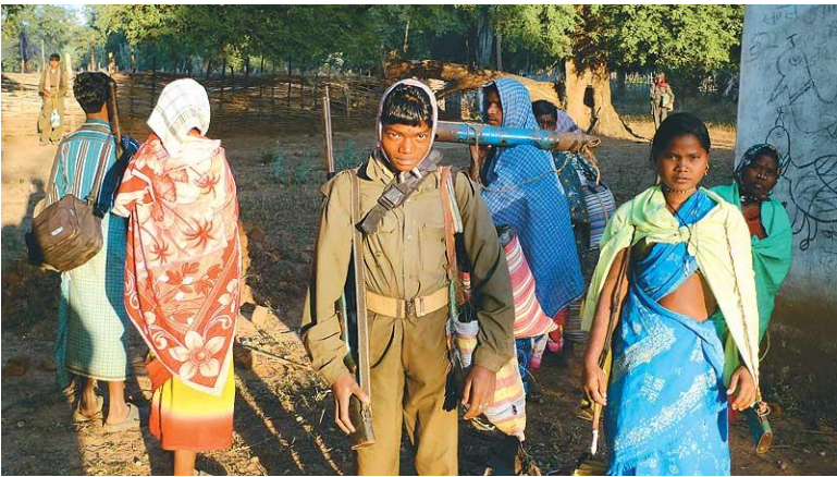
Armed Strugglers: A village militia, the 'base force' of the People's Liberation Guerrilla Army