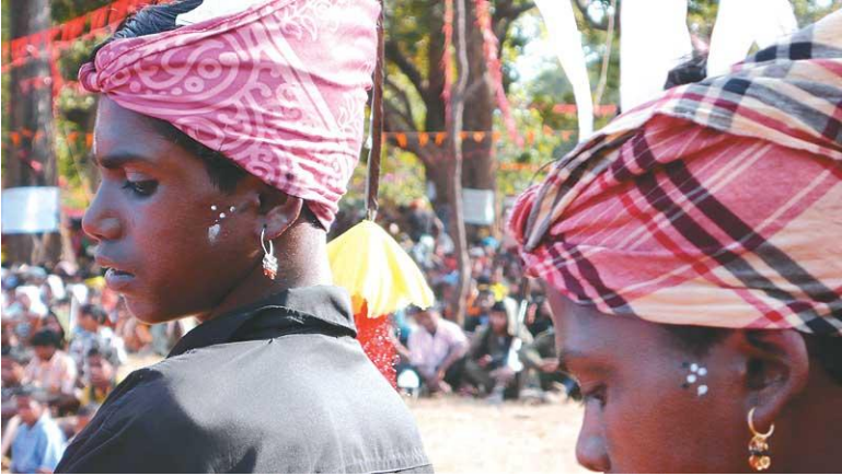
Dressed To The Nines: Adivasi boys in colourful traditional gear for Bhumkal day celebrations