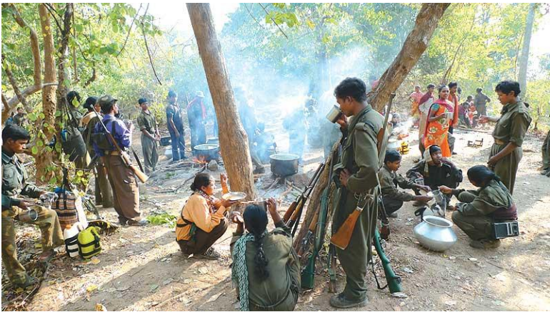
Rest Station: A Maoist 'camp'. When they move, all that will remain is the ash from the kitchen fire.