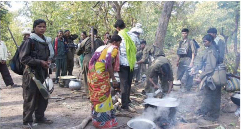
PLGA militants are the hardhitters of the Maoist fighting force.