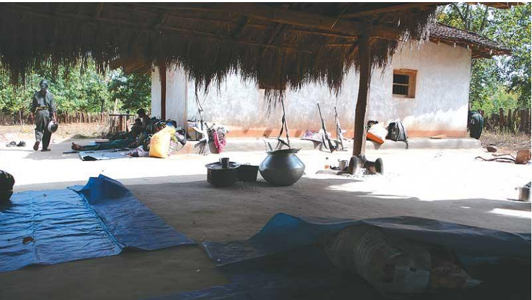
Spare Beauty: Pots, rifles, jhullies... Everything in these villages is clean and necessary