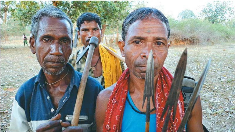
The Damned: Villagers from the submergence area of the proposed Bodhghat dam

An Educational Pamphlet by International Campaign Against War on the People in India www.icawpi.org or write: info@icawpi.org