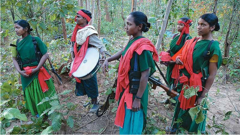
Performing Arts: Members of the Chetna Natya Manch, the cultural wing of the party, waiting in the wings