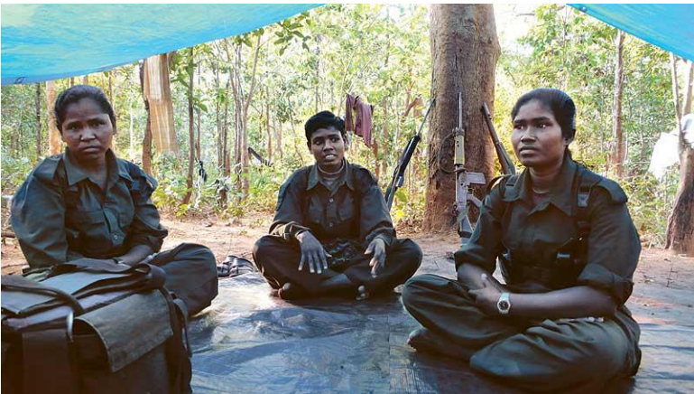
Bob-Cut Brigade: In Bastar, women with a bob-cut haircut can get you killed