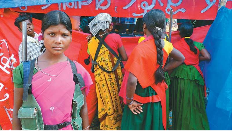
The Day of the Bhumkal: Face to face with "India's greatest Security Threat".